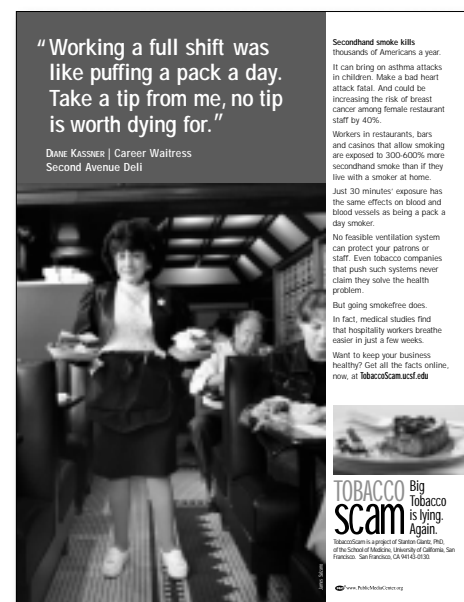
Ad campaign launched August 2002 ▶

TobaccoScam ads in trade magazines urge the hospitality industry to protect itself and go smokefree.