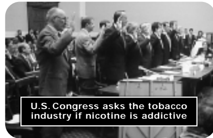
U.S. Congress asks the tobacco industry if nicotine is addictive

ASHRAE or ashtray? Why put your reputation on the line for the tobacco industry?