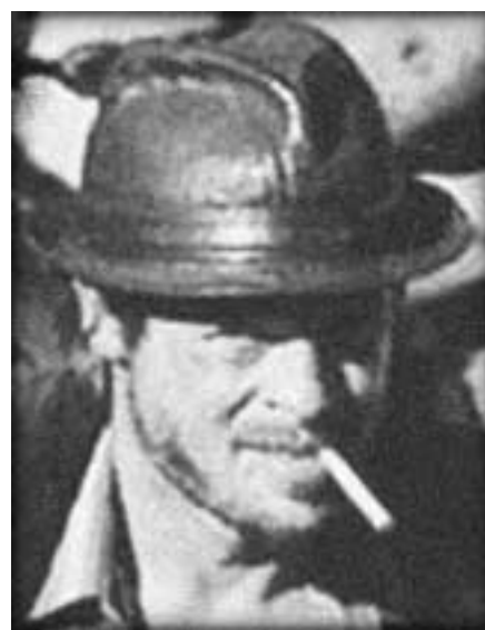
Julia Roberts and Brad Pitt have both taught young audiences how to smoke on screen. Scores of other Hollywood professionals, including many stars, addicted before tobacco’s health dangers were fully known, have died from smoking.

For years, the world’s largest and most powerful tobacco companies secretly paid Hollywood off to get their addictive and lethal products into the movies. The payola supposedly stopped in 1989, after the scandal grew so obvious it brought threats of federal regulation.