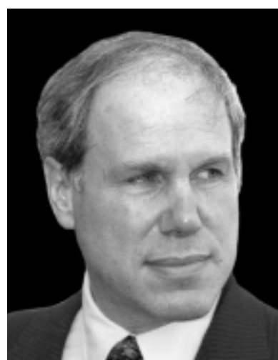
Movie studios controlled by (clockwise from top left) AOL TimeWarner's Steve Case, Viacom's Sumner Redstone, Disney's Michael Eisner and News Corp's Rupert Murdoch all promoted smoking in blockbuster movies over the last ten years. Shareholders have every reason to ask...why?

DiCaprio and Kate Winslet both smoked, equating cigarettes with romance and rebellion for 75 million ticket buyers in the U.S and tens of millions more overseas. Based on comparable TV ad rates alone, Titanic was worth at least $5 million to the tobacco industry,